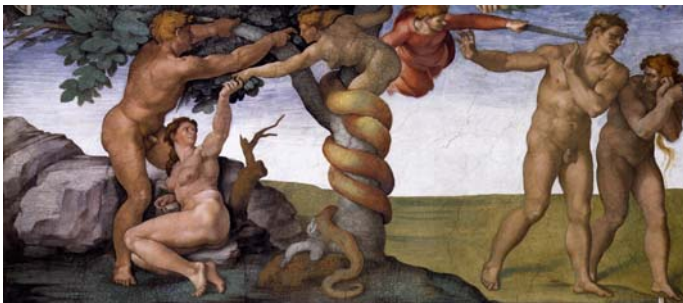
Michelangelo's depiction of the snake tempting Eve in the Garden of Eden

Returning to the early 16 th century, once his creative juices began to flow, Michelangelo decided that his “ordered-piece-of-art” would show the earliest scenes from the Bible, as well as other famous figures. Down the center of the ceiling, he created an impressive collection of images from the Book of Genesis--the creation of Adam, the snake tempting Eve in the Garden of Eden, and Noah’s Ark