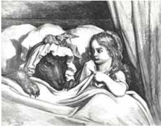
This illustration appeared in Les Contes de Perrault , dessins par Gustave Dore, Paris: J Hetzel, 1867

Red Riding Hood rescues herself. After she is fed a piece of her grandmother by the wolf, she announces that she needs to go to the bathroom. Since this activity is done outside of the structure. This is because this version was written before the common appearance of indoor bathrooms. Once outside, she runs away.