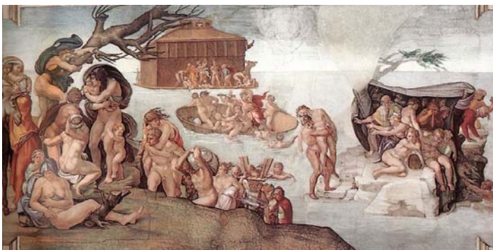
Noah's Ark as painted by Michelangelo

As if a series of sermon topics, Michelangelo's vision exploded. He filled the rest of the ceiling with portraits of prophets like Isaiah and Ezekiel. He imparted his own theology when he added symbols of ancient times, like the Oracle at Delphi,